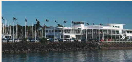
Royal New Zealand Yacht Squadron

Pre Dinner Drinks and Conference Dinner (including the NZSTA Awards/Grants ceremony, together with an introduction to the campaign Champions. Dress code for the Conference Dinner is Black tie and cocktail attire.)