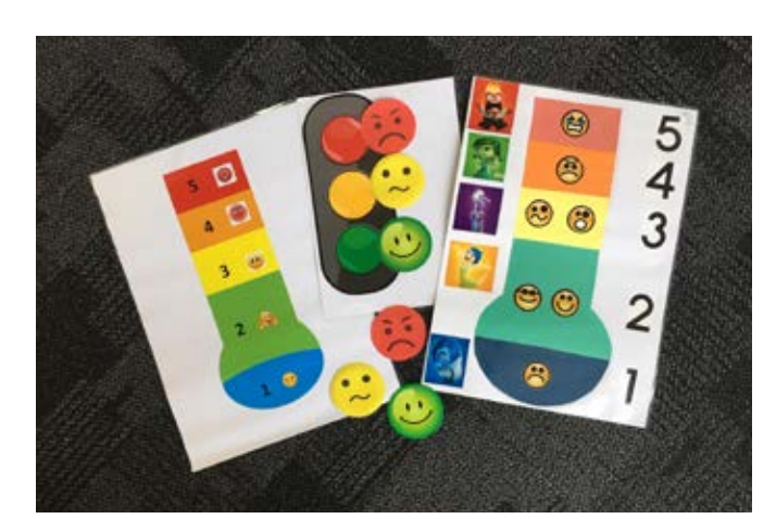
Left: Emotion thermometers and traffic light.

There are a variety of ways to use colours to develop communication tools for expressing emotions. Traffic lights and thermometers are often used as a way to introduce the concept of colour for emotions. For example, an "emotions traffic light" can be depicted with the green light indicating when we are happy or good, red when we are upset or angry, and orange indicating when we are getting upset or feeling frustrated.