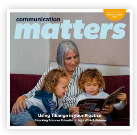
The Spring 2020 issue is available on the NZSTA website .

Please think about passing your copy to colleagues, friends and whānau to read when you have savoured it's content. Consider leaving it in a waiting room or library for others to enjoy.